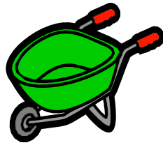
Work in the Garden