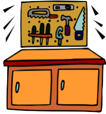
Clean the Garage