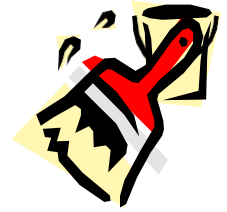
Paint the House